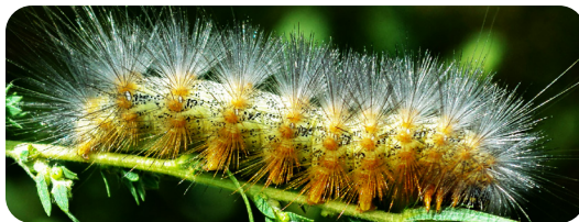
Larva of the saltmarsh moth, Estigmene acrea (Erebidae).