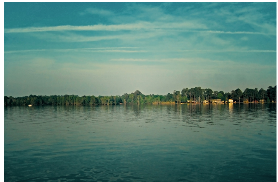
LAKE BLACKSHEAR, 2011