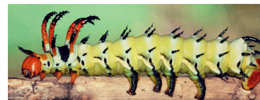
Hickory Horned Devil Caterpillar of the Regal Moth ( Citheronia regalis)