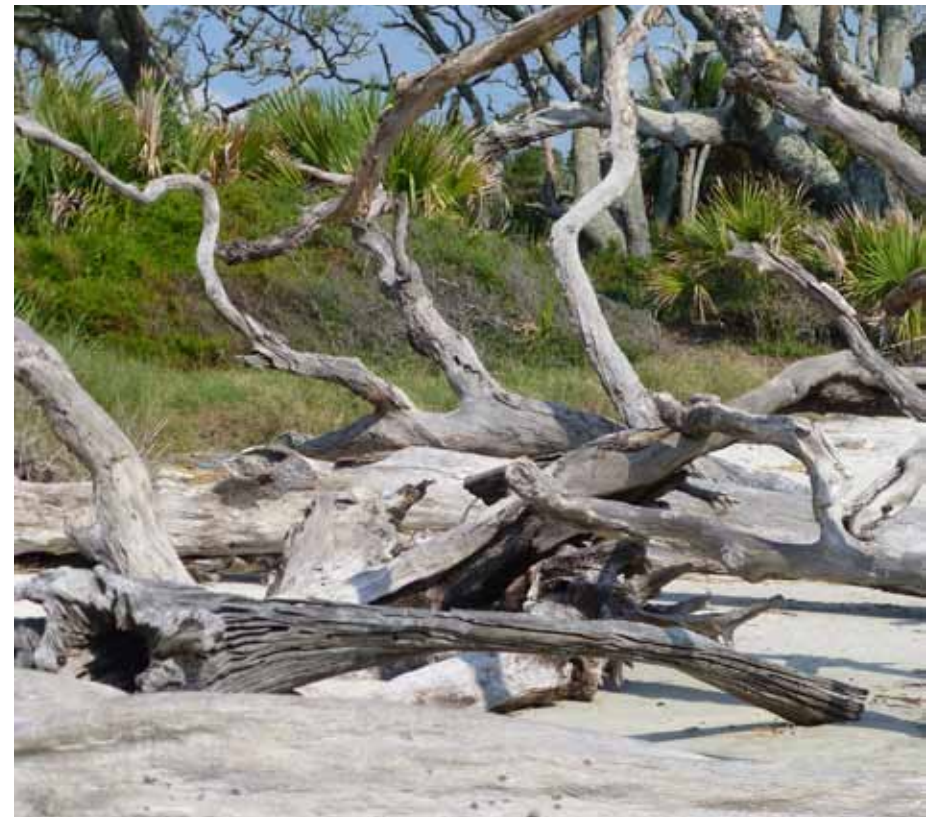
JEKYLL ISLAND BONEYARD BEACH