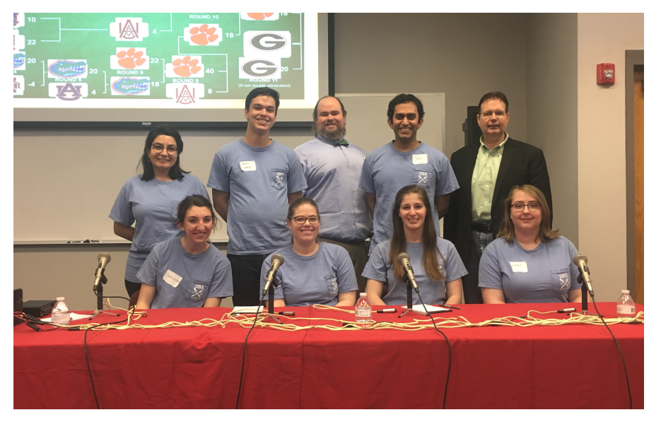
Food Science & Technology students and faculty pose with smiles on their faces after winning first prize in IFT's 2018 South Eastern Regional College Bowl Competition.